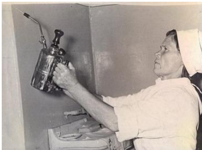
Fig. 5 Sanitary treatment of premise

The heroic work of workers and engineering and technical staff of the rear factories in the years of war also required the attention of sanitary services. Surviving all the difficulties of war – malnutrition, deficit of necessary things – the people performed the work, sometimes not leaving the shops during the whole days (fig. 6).