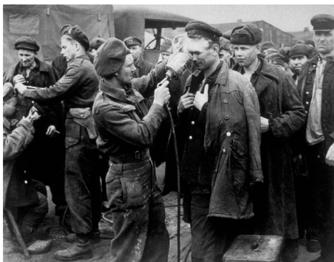
Fig. 4. Disinfective measures at the railway station

In order to prevent the increase in the morbidity with spotted fever in the conditions of the rapid worsening of the everyday life of population the large scope of disinfective measures was implemented (fig. 4).