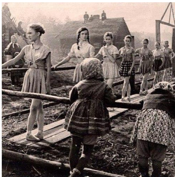
Fig. 3. The students of Leningrad choreographic school evacuated to Molotov at the lessons in village, where they were temporary accomodated.

The evacuated people were located in the regional center, district centers and neighboring villages (fig. 3).